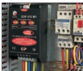
ESP 415 M1 installed within a control panel on the mains input to protect the panel's control systems. Note the remote indication connection (top of protector).

If you desire a protector with an extra high maximum surge current use the ESP 415 M2 or M4. If your supply is fused at 16 amps, or less, the in-line protectors (ESP 120(or 240)-5A(or -16A) and their ready-boxed derivatives) may be more suitable. If you need to mount the display panel separately from the main protector unit, use the ESP 415 M1R.