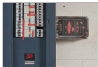
An ESP 415 M1 mounted, within a WBX 4 enclosure, directly alongside a mains panel and connected to its first outgoing way. Note how the protector is mounted on its side to help keep its connecting leads as short as possible.

Use on mains power distribution systems to protect connected electronic equipment from transient overvoltages on the mains supply, eg computer, communications or control equipment.