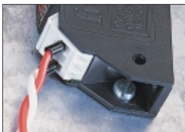
Protector flat mounted on side.

A PCB mount version is available. For many twisted pair data and signal applications, the lower cost D Series may be suitable. For applications requiring higher current (1.25A – 4A) or ultra low in-line resistance, the protectors (H Series) may be more suitable. For data and signal lines on LSA-PLUS modules, use the KS Series.