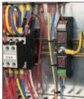
ESP 30E installed on top hat DIN rail inside a process control cabinet.

A PCB mount version is available. For many twisted pair data and signal applications, the lower cost D Series may be suitable. For applications requiring higher current (1.25A – 4A) or ultra low in-line resistance, the protectors (H Series) may be more suitable. For data and signal lines on LSA-PLUS modules, use the KS Series.