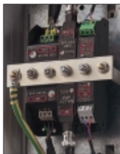
To protect an outside CCTV camera, protection on the power supply (here an ESP 240-5A) is installed alongside video and telemetry line protection, on a CME 4 (mounting and earthing kit), inside a WBX 4/GS enclosure.

To protect equipment inside a building from transients entering on an outgoing feed (eg to CCTV cameras or to site lighting) the protector should be installed as close to where the cable leaves the building as possible. Unless ready-boxed, protectors should be installed either within an existing cabinet/cubicle or in a separate enclosure.