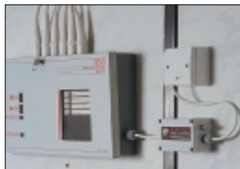
Ready boxed protector (here an ESP 240-5A/BX) installed on the fused connection (spur) to an alarm panel.

Use these protectors on low current mains power supplies, eg CCTV cameras, alarm panels and telemetry equipment.